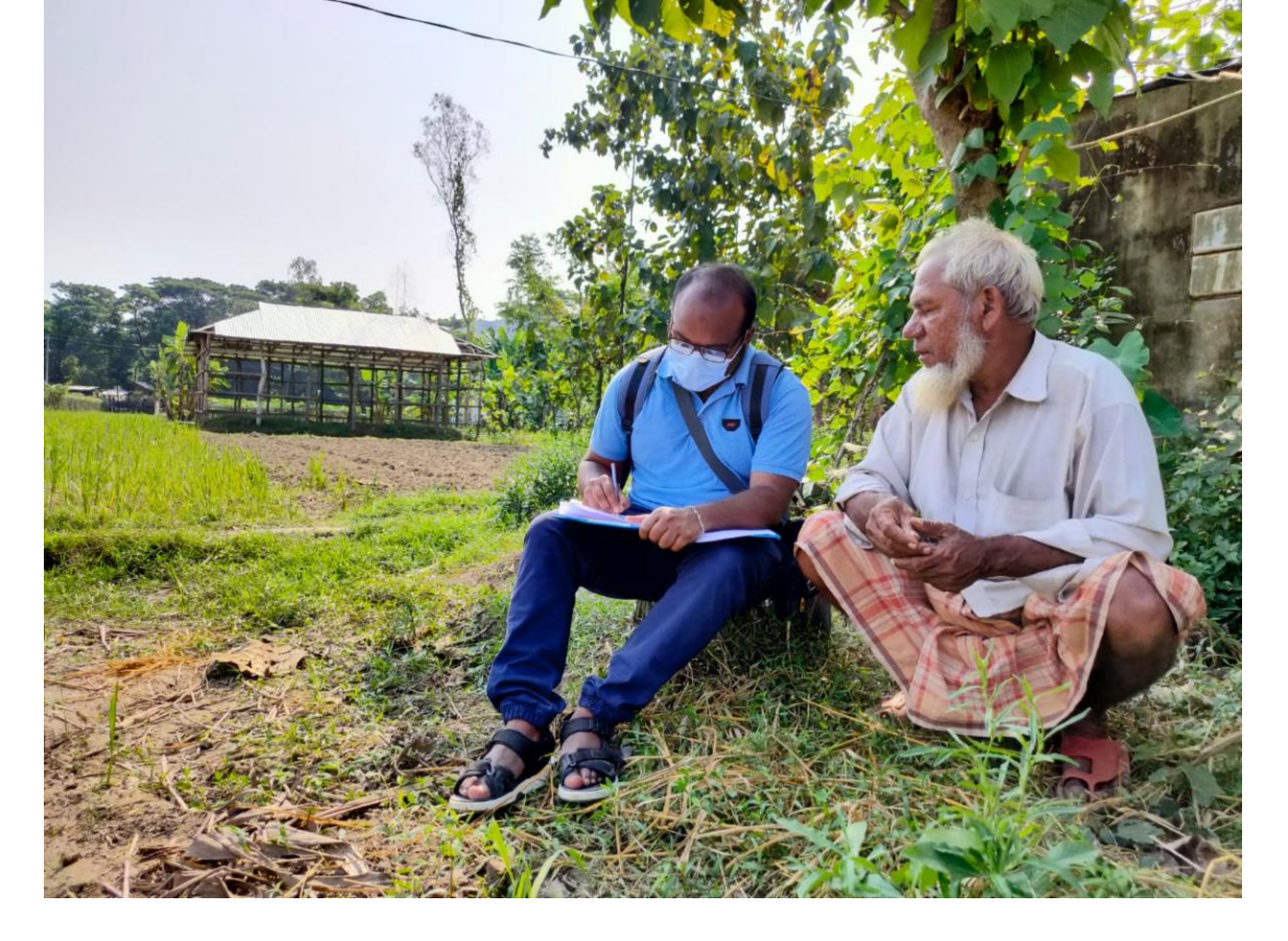
Interview by Fahal Alam